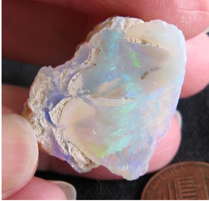
13. $120 IMG_2509 Lightning Ridge Rub