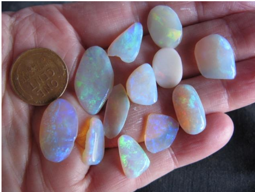
24. $300 IMG_8897 Multi Colour some Gems faced (12 stones) $25 each 36.25cts