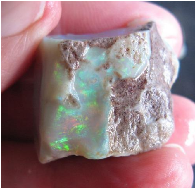
39. $1,008 IMG_8915 Coober Pedy Greens & Golds $700/oz 1.44oz