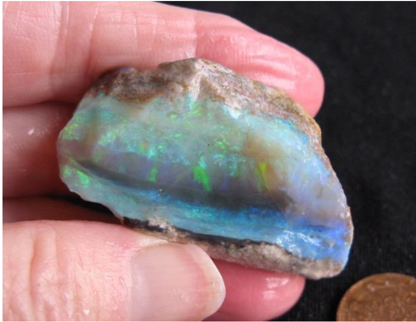
41. $1,200 IMG_8342 Mintubi Gem (4 stones not just 1 stone) .88oz