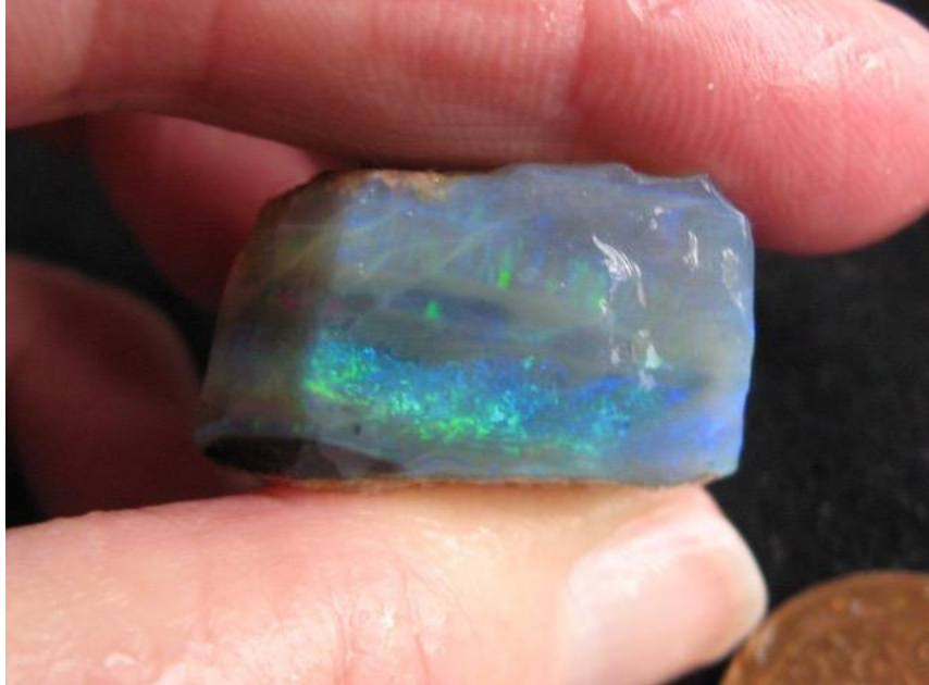
31. $675 IMG_8332 Mintubi Gem Greens & Blues 38mm x 20mm x 11mm .73oz