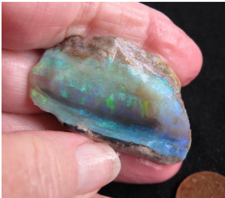
40. $1,200 IMG_8341 Mintubi Gem (4 stones not just 1 stone) .88oz