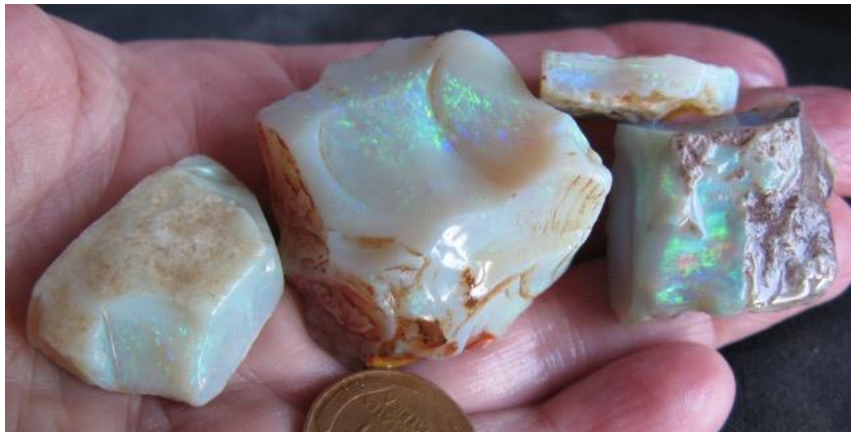
36. $1,008 IMG_8908 Coober Pedy Greens & Golds $700/oz 1.44oz