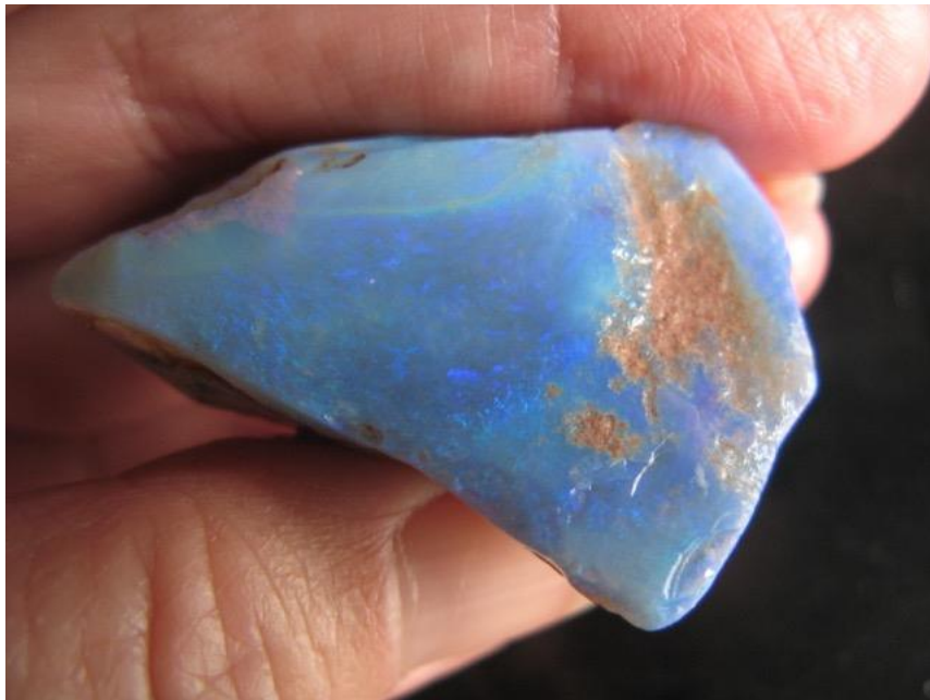
28. $475 IMG_5643 Coober Pedy brilliant Blue Green 43mm x 30mm x 12mm .41oz