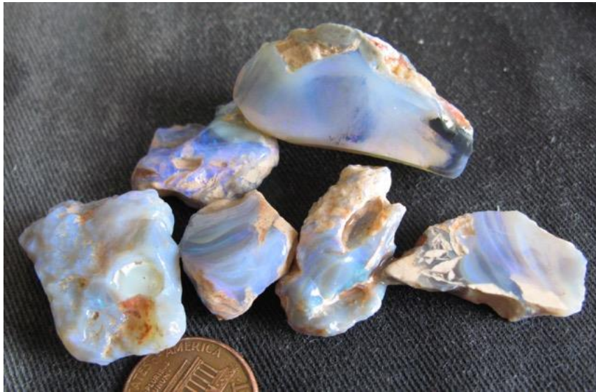
14. $125 IMG_1565 Lightning Ridge Blues 1oz