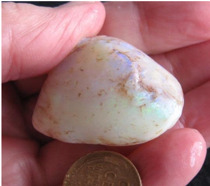
34. $875 IMG_8300 Coober Pedy Shell perfect shape Blues Greens Gem Bar Green Gold, a beauty and bargain 36mm x 30mm x 22mm 126cts/.894oz