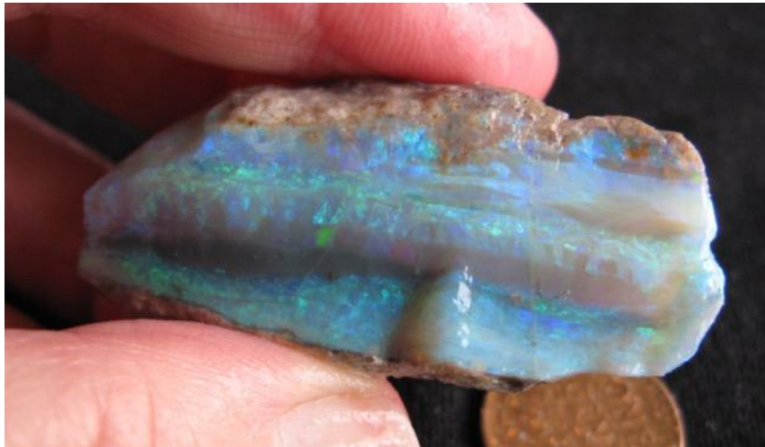
42. $1,200 IMG_8346 Mintubi Gem (4 stones not just 1 stone) .88oz