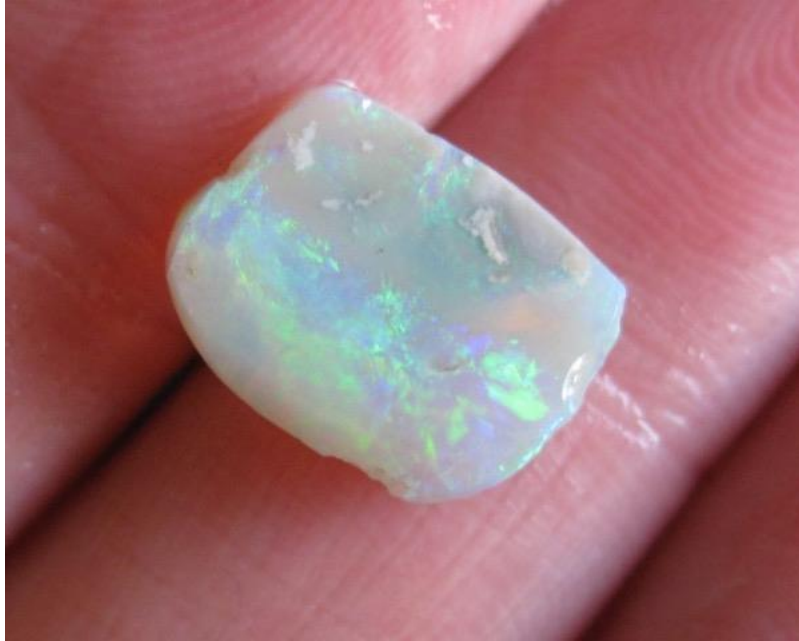
5. $65 IMG_9037 Lightning Ridge Rub .0174oz