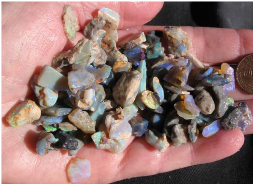
22. $240 IMG_1644 Lightning Ridge small stones $150/oz 1.6oz