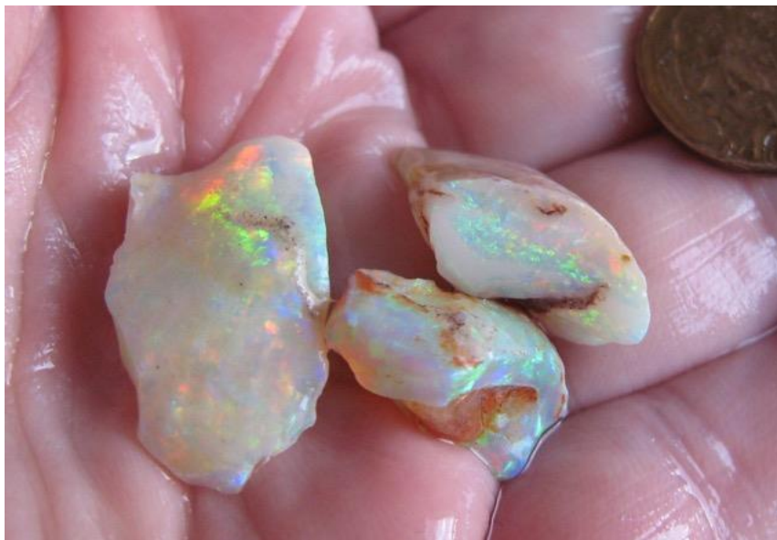
26. $436 IMG_8316 Shell pieces Reds & Greens superb colours brilliant Gems use a dremel $96/gram 4.55 grams