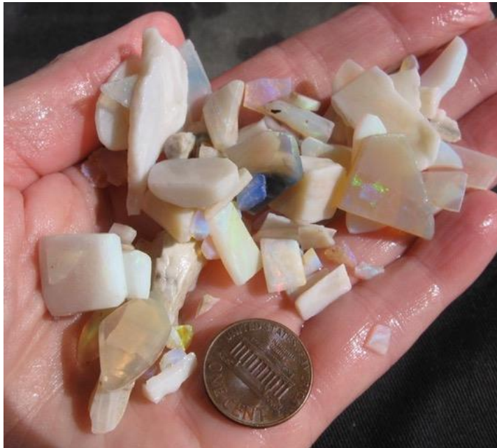
2. $44 IMG_1258 Sliced offcuts $40/oz 1.1oz