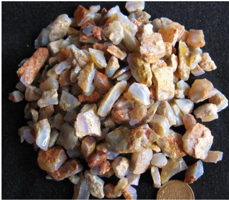
10. $107 IMG_8348 Mintubi small stones & chips bright Blue Green $25/oz 4.3oz