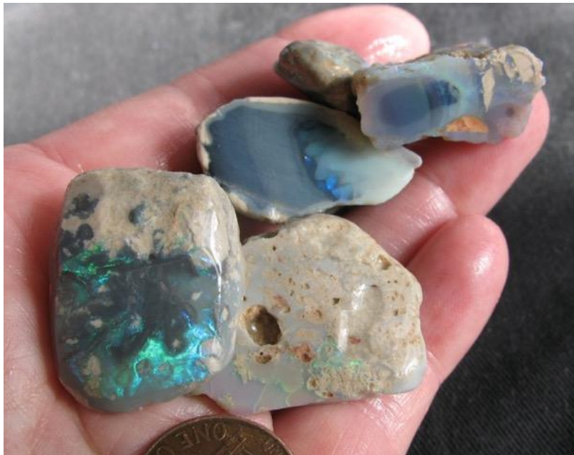
8. $99 IMG_1746 Lightning Ridge (1 beautiful Green stone) 1.1oz