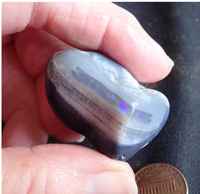
4. $52 PA102035 Lightning Ridge big lump some colours 24.5 grams