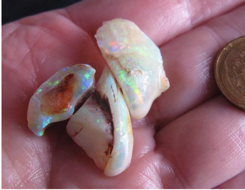
27. $436 IMG_8319 Shell pieces Reds & Greens superb colours brilliant Gems use a dremel $96/gram 4.55 grams