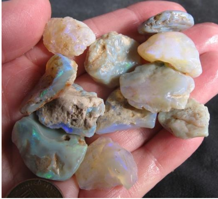
11. $110 IMG_1727 Lightning Ridge Mixed Blues Greens great value $100/oz 1.1oz