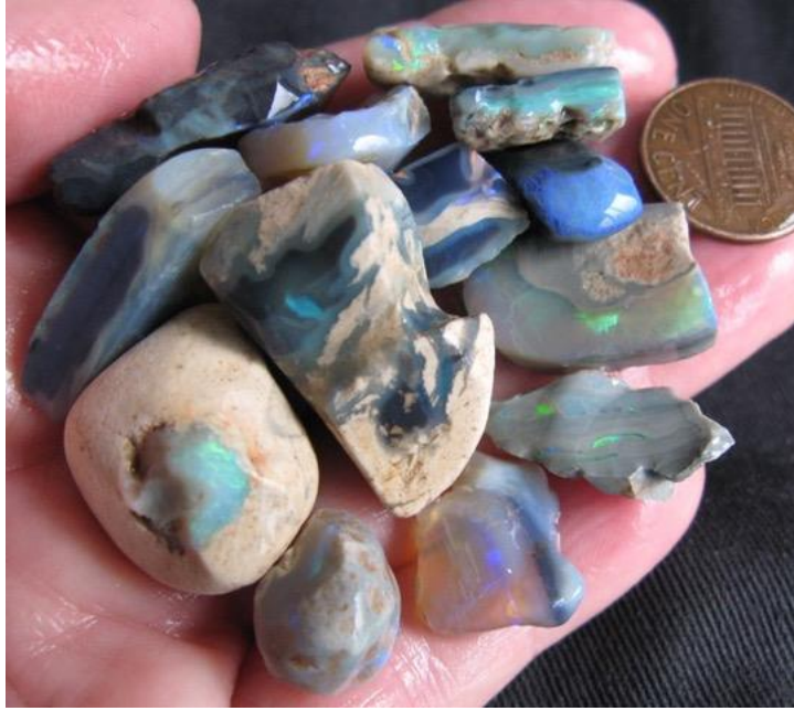
23. $256 IMG_1220 Lightning Ridge including Blacks $200/oz 1.28oz