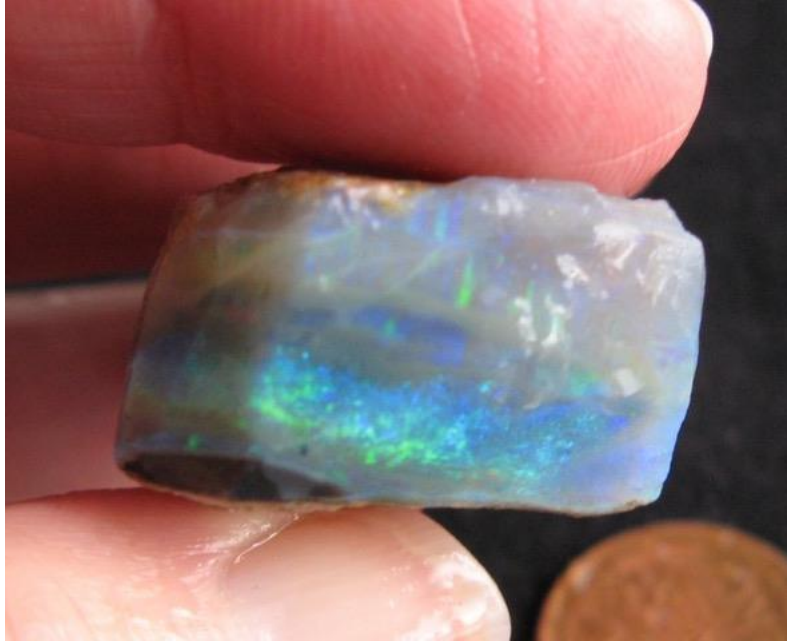
33. $675 IMG_8337 Mintubi Gem Greens & Blues 38mm x 20mm x 11mm .73oz