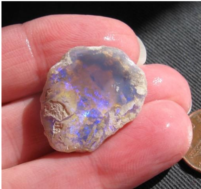
12. $120 IMG_2541 Lightning Ridge Rub