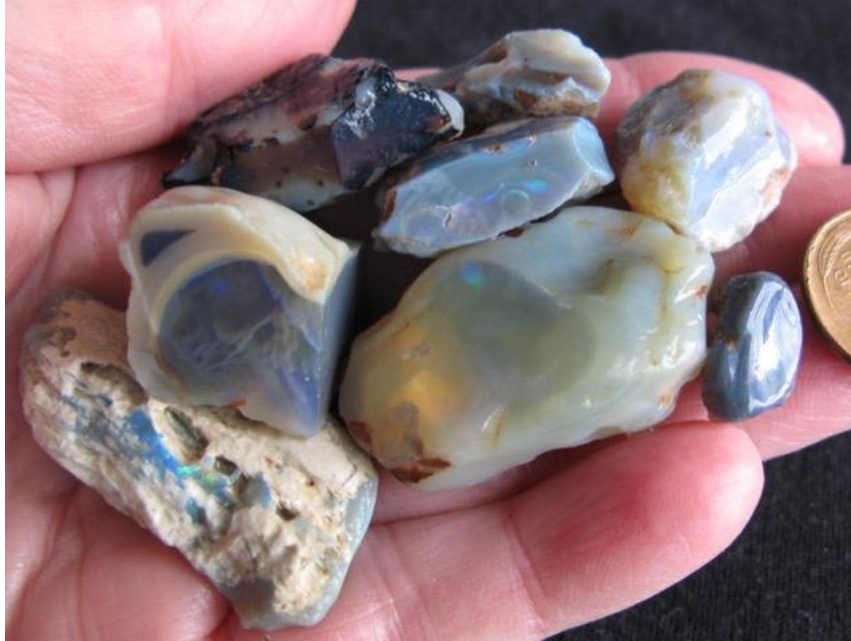
7. $90 IMG_8293 Lightning Ridge some nice Blues & Greens $50/oz 1.8oz