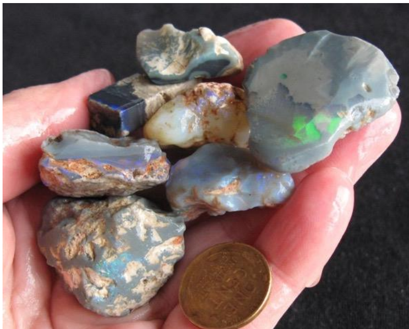
6. $76 IMG_8299 Lightning Ridge each stone a little colour, could be a mild surprise, Murray $45/oz 1.7oz