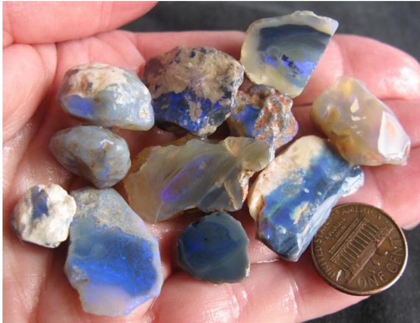
25. $325 IMG_1707 Lightning Ridge mostly Black opal Electric Blues 1oz