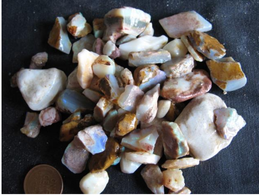
15. $120 IMG_8950 Mixed Opal some small stones very very bright $40/oz 3oz