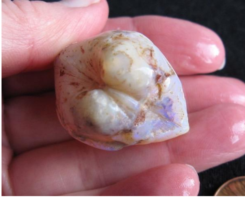
35. $875 IMG_8303 Coober Pedy Shell perfect shape Blues Greens Gem Bar Green Gold, a beauty and bargain 36mm x 30mm x 22mm 126cts/.894oz