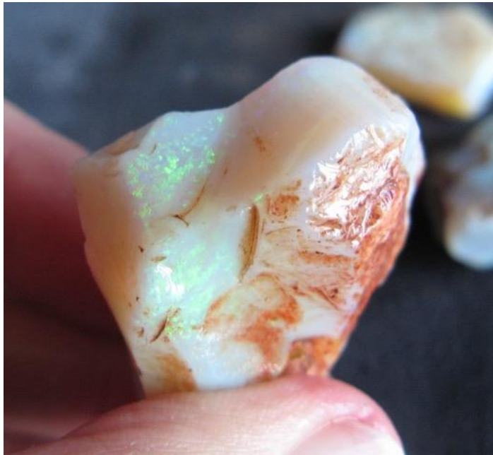
38. $1,008 IMG_8912 Coober Pedy Greens & Golds $700/oz 1.44oz