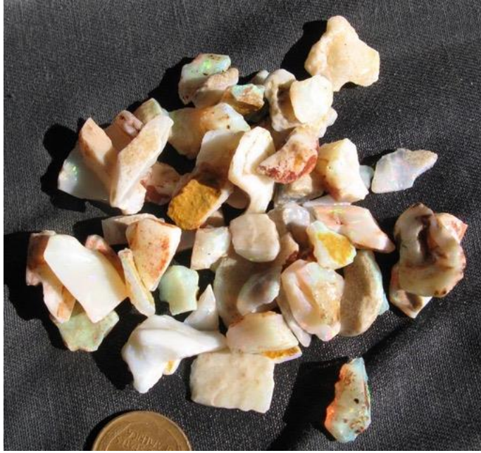
29. $620 IMG_0643 Small stones Reds Golds Greens even a few little Black brilliant small stones $500/oz 1.2oz