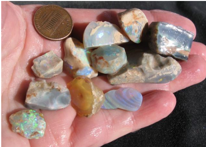
16. $133 the lot IMG_1583 Lightning Ridge interesting stones .91oz