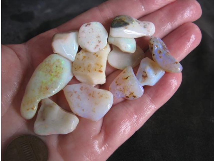
17. $150 IMG_5523 Tumbled Opals 12 stones .99oz