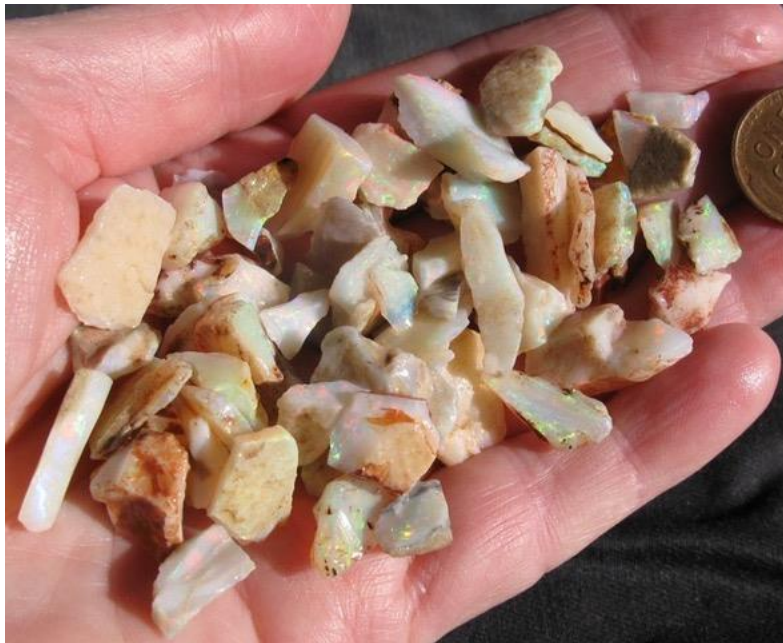
30. $620 IMG_0646 Small stones Reds Golds Greens even a few little Black brilliant small stones $500/oz 1.2oz