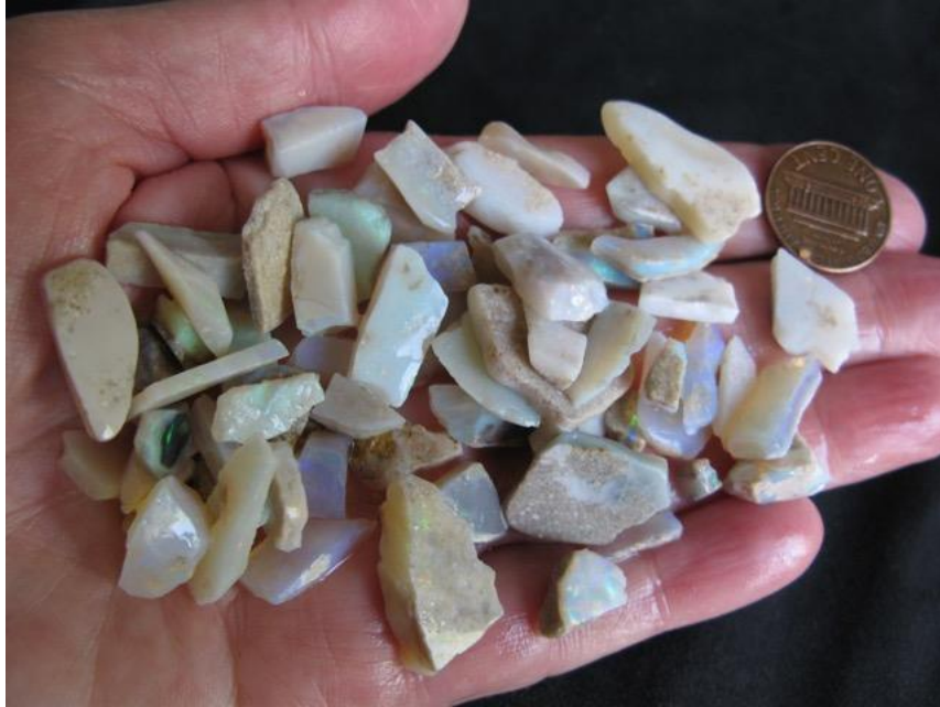
3. $46 IMG_6379 Mintubi sliced chips multi coloured 1.3oz