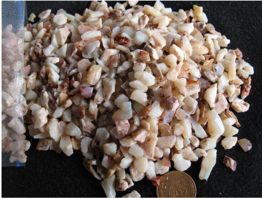
1. $37.50 IMG_8351 (MW) Coober Pedy White Base Chips $7.50/oz 5oz