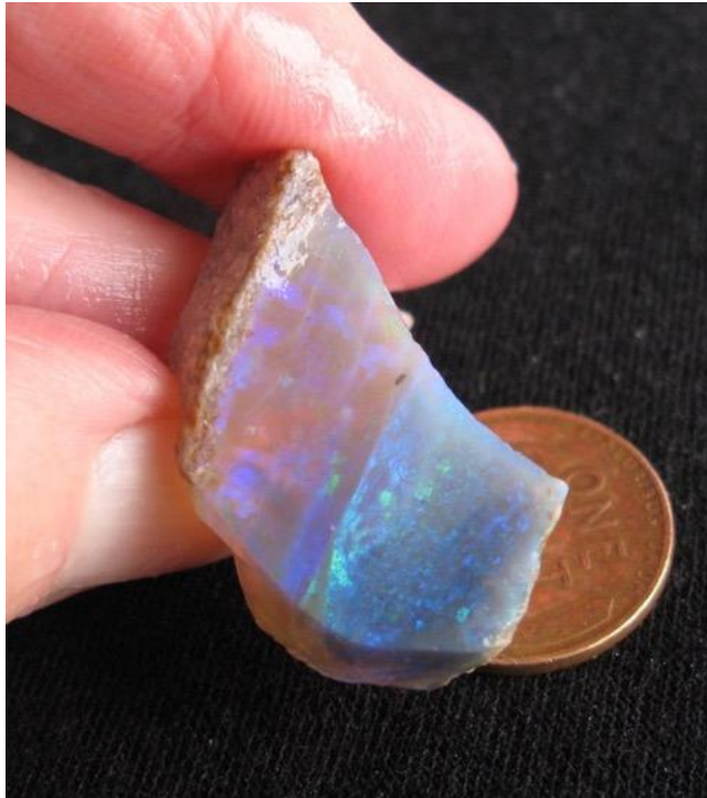
21. $225 IMG_8329 Mintubi brilliant Blues & Greens 23mm x 15mm x 9mm .2oz