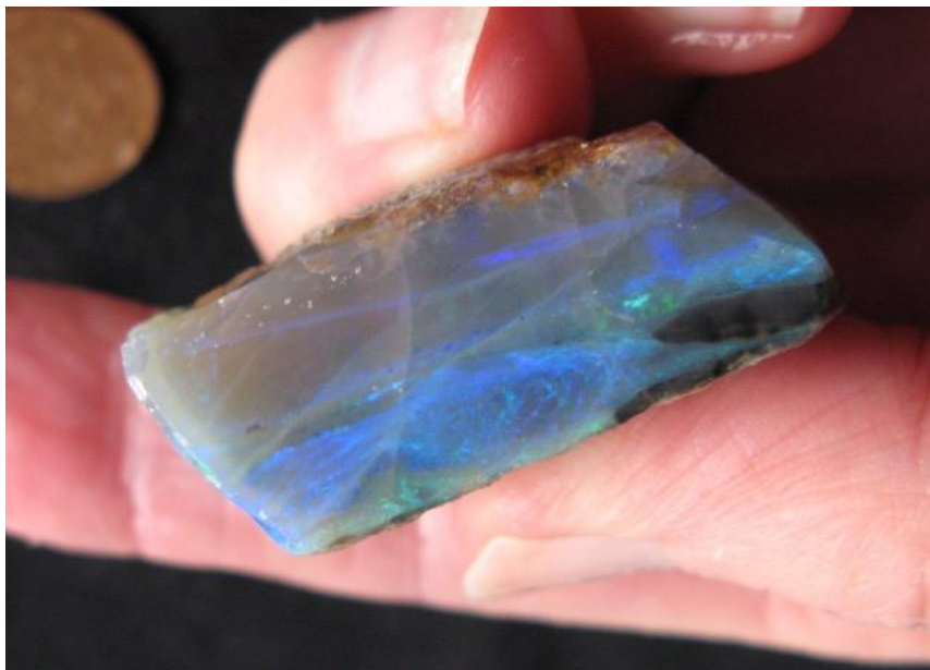
32. $675 IMG_8335 Mintubi Gem Greens & Blues 38mm x 20mm x 11mm .73oz