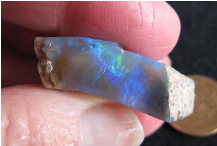
20. $225 IMG_8327 Mintubi brilliant Blues & Greens 23mm x 15mm x 9mm .2oz