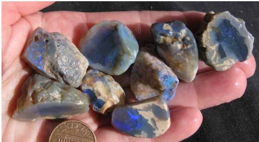
18. $175 IMG_1702 Lightning Ridge Electric Blues $100/oz 1.75oz