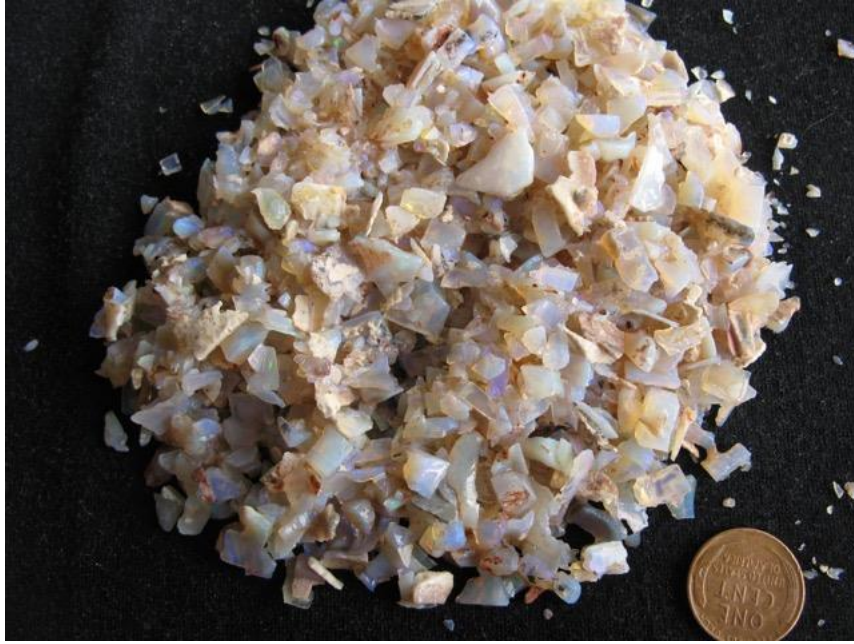
9. $100 IMG_8358 Offcuts & Chips very bright 3.8oz